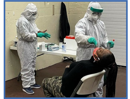
The Douglas Center conducts weekly Covid-19 testing for all staff and participants..